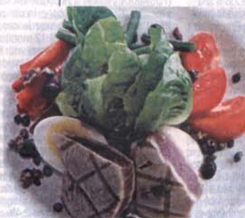
CAPITAL DINING Salad niçoise at Chef Mavro.

is Turtle Bay Resort which is an excellent spot for an overnight stay. Ten minutes farther on is the surf-crazed town of Haleiwa , where you can inspect the funky shops and cafés, then head through pineapple country directly back to Honolulu, a scant hour but several eras away.